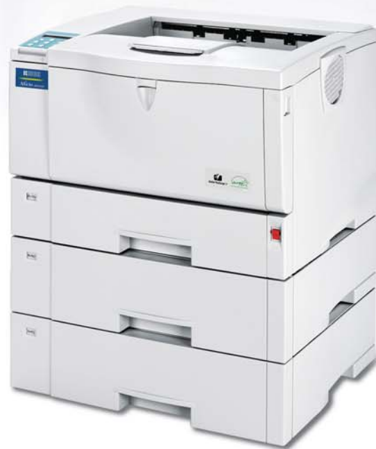
Fully configured Ricoh Aficio AP610N

When time is money, this workhorse printer won't disappoint. The AP610N's large expandable paper supply, easy maintenance, intuitive management utilities, and wide variety of connectivity options, including wireless, enable you to achieve maximum office productivity. Setting a new standard in workgroup printers, the affordable AP610N's seamless network integration, high reliability, and cost-efficiency make it an exceptional value...one uniquely engineered to boost your bottom line.