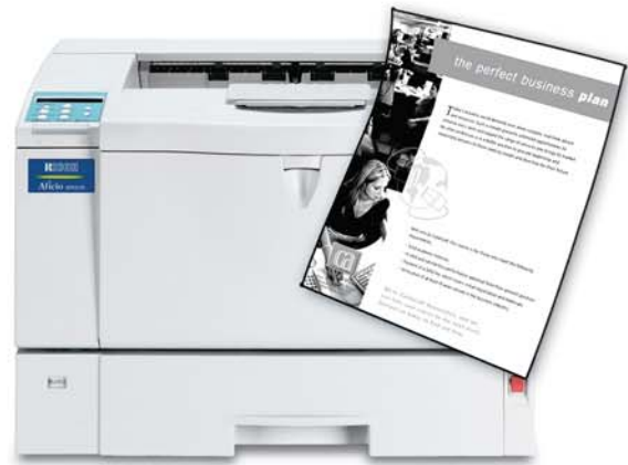
Sample Print outputs one complete set for review before producing multiple sets, reducing waste and time.