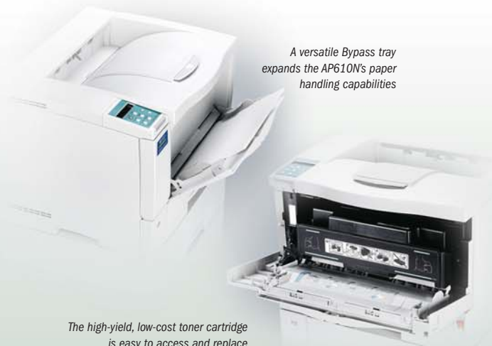
A versatile Bypass tray expands the AP610N's paper handling capabilities

A standard 500-sheet paper supply holds a full ream of letter-size paper and offers a versatile 100-sheet bypass (standard). Print onto plain paper, up to 11" x 17", and a wide range of media types, including transparencies, card stocks, recycled papers and custom paper sizes. Print envelopes with ease — up to 10 via the bypass or 60, via the optional Envelope Cassette. The optional Duplex Unit cuts paper usage, saving money and filing space. Add one or two 500-sheet paper feed trays to take your total paper capacity to 1,600 sheets , minimizing work interruptions.