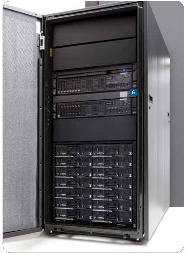
The RICOH TotalFlow® Print Server R600A Digital Front End is scalable to support a range of complex jobs.

The RICOH Pro VC70000 doesn't just enable better results, it makes it easier to help your operators achieve them. In fact, the interface can be fine-tuned and customized to suit operators with a range of experience and technical expertise. The system's GUI provides intuitive control of the RICOH TotalFlow® Print Server R600A DFE. Access tools, such as job setup and management tools, plus administrative and maintenance menus quickly. An operator attention light clearly lets staff know, from anywhere on your shop floor, when the system needs intervention.