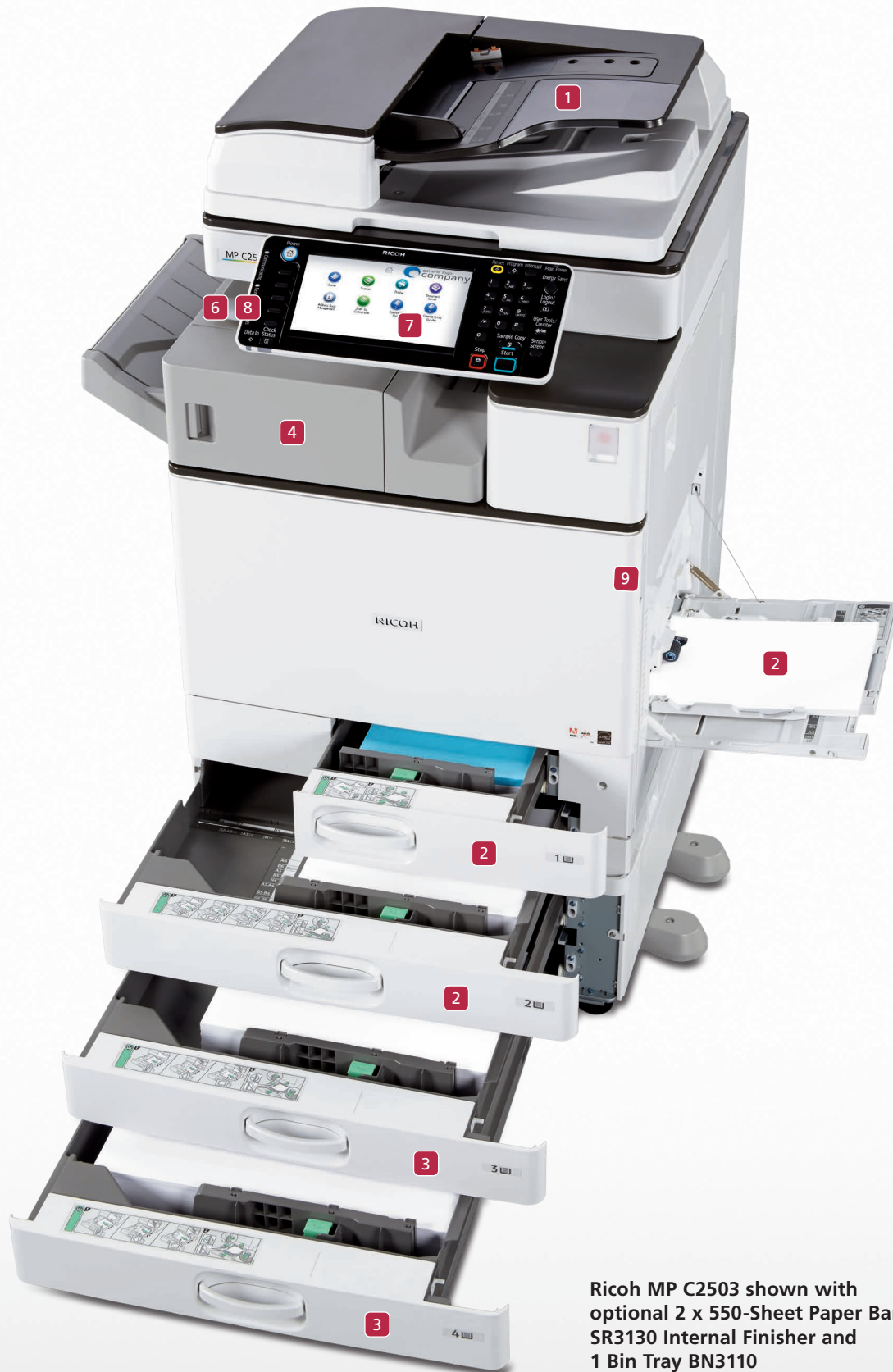
Ricoh MP C2503 shown with optional 2 x 550-Sheet Paper Bank, SR3130 Internal Finisher and 1 Bin Tray BN3110