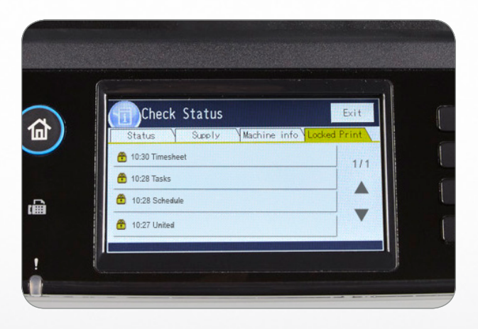
To view detailed features of our multifunction products online go to www.ricoh-usa.com/products

Add more value by adding restrictions with user codes, such as limiting color print functions to save on toner supplies. The SP C262SFNw gives you even more control over operating costs by letting you restrict users from performing additional functions, such as full-color copying. Plus, with the Locked Print feature, you can require users to enter a four-to-eight digit pass code before releasing a job—helping to ensure documents aren't left unattended at your printer or MFP. This also helps to reduce paper consumption and keep important information safe.