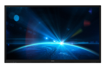
A8600 For larger conference rooms, K-12 classrooms, and higher education lecture halls