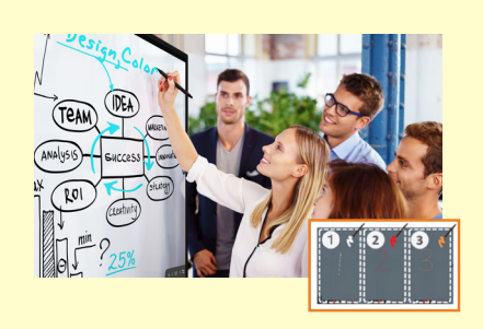
Whiteboarding with Split Screen capability allows multiple users to write on the board simultaneously