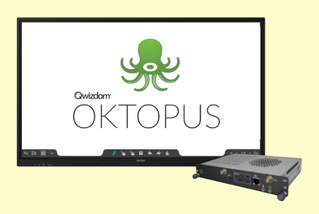
Add the optional Education Controller with Qwizdom® OKTOPUS™ software and MimeoConnect™ for more compelling and interactive student lessons

Every A-Series model displays highly detailed images at 4K resolution from behind a pane of 3.2 mm reinforced antiglare glass that stands up to daily use. All offer a customizable Home screen for easy access to the most frequently used functions, and all attach to the same optional rolling stand, wall mount, and video conferencing accessories. The only difference is the screen size for a seamless user experience across all A-Series IFPDs.