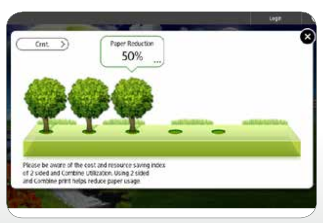
Eco-Friendly Indicator Screen as shown on the Smart Operation Panel.

You'll find just the opposite to be true with the Ricoh MP 4054/ MP 5054/MP 6054. It offers low cost-per-page and best-in-class typical electricity consumption (TEC) values so you can reduce costs while meeting your sustainability goals. With a shorter recovery time of less than 5 seconds from sleep mode, the Ricoh MP 4054/ MP 5054/MP 6054 keeps up with today's fast-paced business environment. You can program the device to power on or off during specified times to conserve energy for even greater savings. Plus, the device meets EPEAT® Gold* criteria — a global environmental rating system for electronic products — and is certified with the latest ENERGY STAR™ specifications.