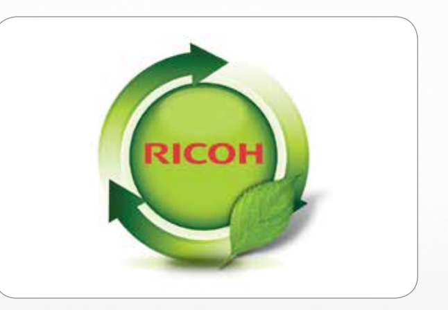
To view detailed features of our products online go to www.ricoh.ca/products