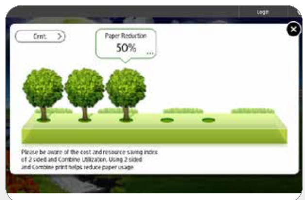
Eco-Friendly Indicator Screen as shown on the Smart Operation Panel.

You'll find just the opposite to be true with the Ricoh MP 4054/MP 5054/MP 6054. It offers low cost-per-page and best-in-class typical electricity consumption (TEC) values so you can reduce costs while meeting your sustainability goals. With a shorter recovery time of less than 5 seconds from sleep mode, the Ricoh MP 4054/MP 5054/MP 6054 keeps up with today's fast-paced business environment. You can program the device to power on or off during specified times to conserve energy for even greater savings. Plus, the device meets EPEAT® Gold* criteria — a global environmental rating system for electronic products — and is certified with the latest ENERGY STAR™ specifications.