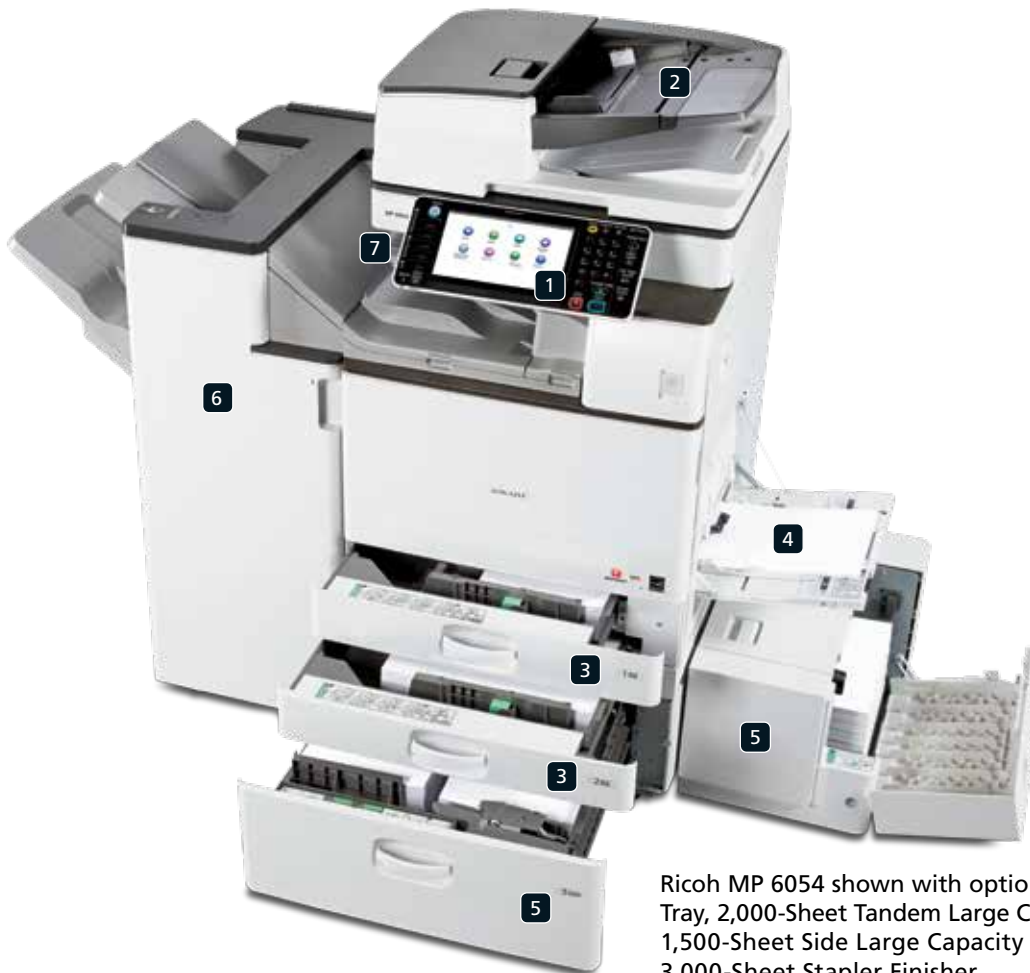
Ricoh MP 6054 shown with optional One-Bin Tray, 2,000-Sheet Tandem Large Capacity Tray, 1,500-Sheet Side Large Capacity Tray and 3,000-Sheet Stapler Finisher.