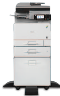
MP C305 with optional PB1050 Paper Tray