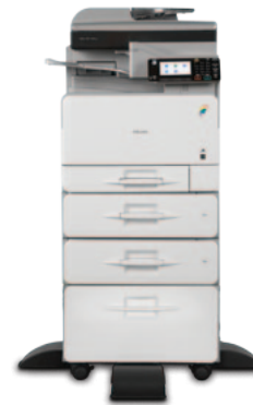
MP C305 with two optional PB1050 Paper Trays