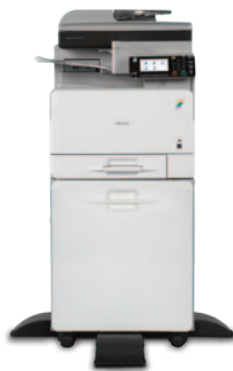
MP C305 with one bin tray

Some features may require additional options.