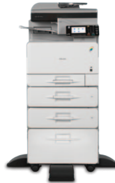
MP C305 with two optional PB1050 Paper Trays