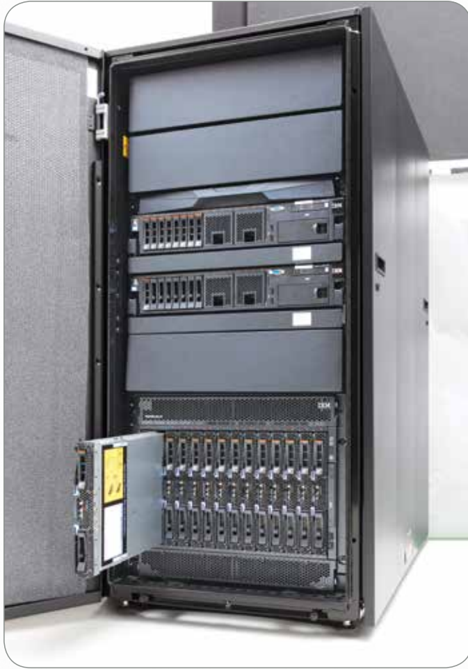
The RICOH TotalFlow® Print Server R600A, a powerful and scalable platform that can be expanded to keep up with increasing complex print applications.