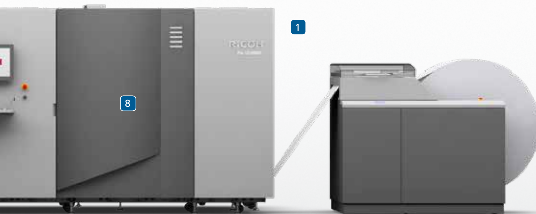
RICOH Pro VC40000